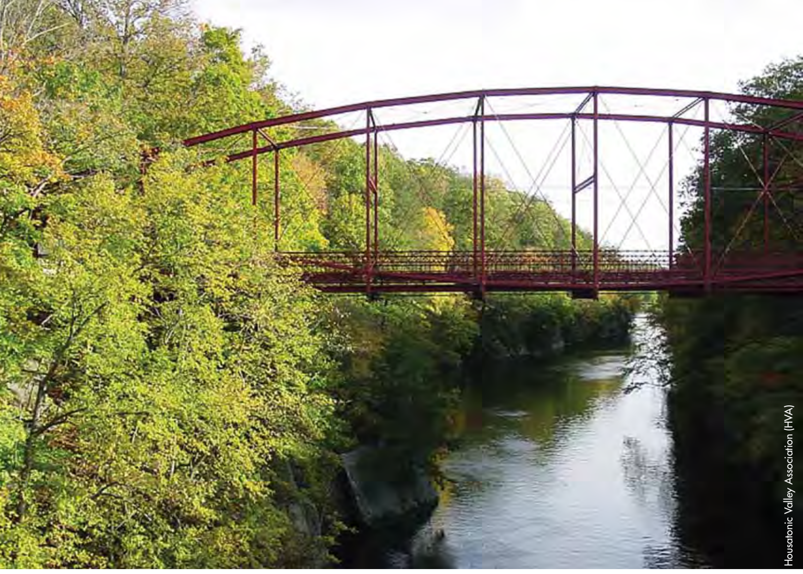
Lovers Leap Bridge

also allows municipalities to contract with service companies to perform energy efficiency improvements without the need for towns to issue bonds. The law expands consumer financing options for efficiency and renewable energy projects by broadening the Clean Energy Fund into the Clean Energy Finance and Investment Authority, and by authorizing municipalities to create Property Assessed Clean Energy (PACE) financing districts. In these districts, the municipality may allow private property owners to make renewable energy or energy efficiency improvements with no upfront costs. The assessments are repaid through a charge on property tax bills of participating residents. The assessment obligation remains with the property and passes to the next owner. CTLCV did not score this legislation because the actual language was not available until the final chamber votes, and therefore we were not able to issue an alert to legislators.