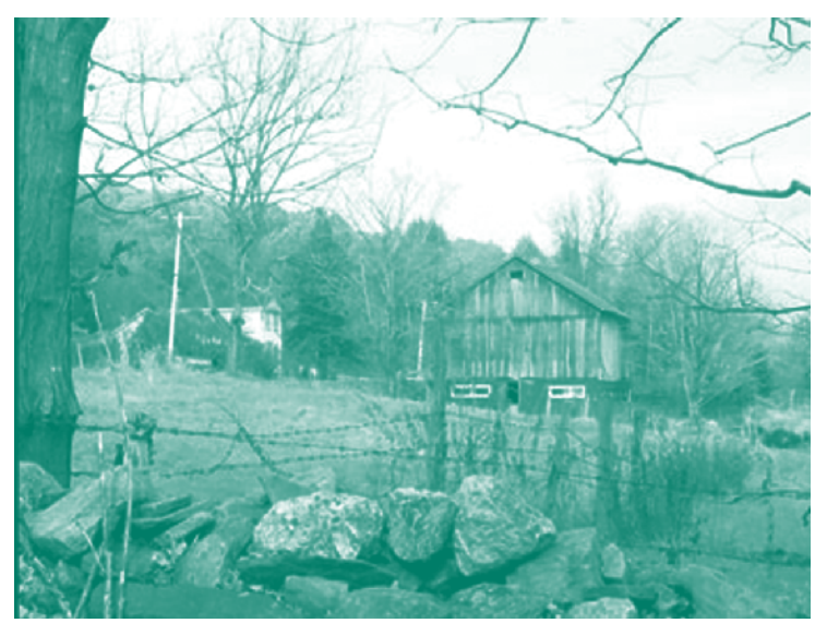
SB 872 secures the Governor's promise of spending $20 million in state bonding over the next two years for the DOA's Preservation Program.