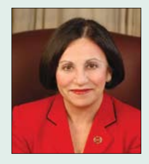
Sen. Toni Boucher