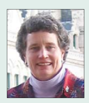
Rep. Beth Bye