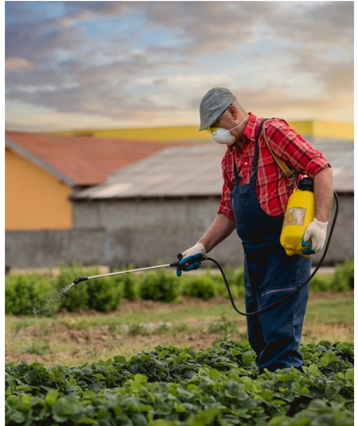
Chlorpyrifos is a dangerous pesticide that clogs up our air and water when sprayed on agricultural land.

Unfortunately, due to major lobbying efforts from the pesticide industry, national agricultural interests, and other big businesses and third parties, neither of these bills passed.